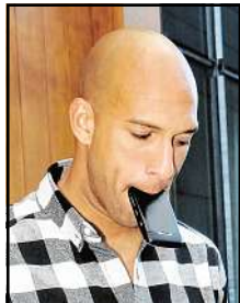
GOALIE: Tim Howard