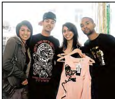
SHOPPING TRIP: B2K

SHOPPERS at Bold Street's Resurrection clothing store found themselves sifting through the rails alongside platinum-selling US boy band B2K .